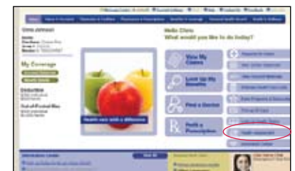
Accessing the Health Assessment