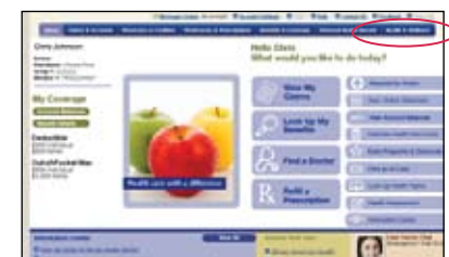
Accessing the Online Coach – "Health & Wellness" tab

myuhc.com technical support: 1-877-844-4999 8 a.m. – 10 p.m. (EST) Monday – Friday