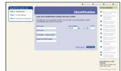
Enter your identification number and Date of Birth or Social Security.