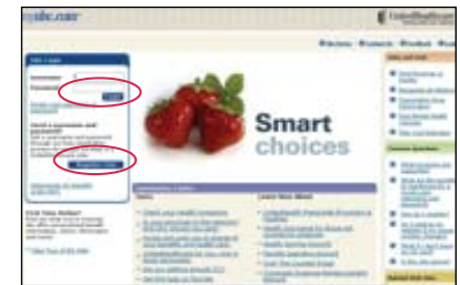
Logging on to myuhc.com